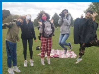
Participants in Unity Chicago's Youth Programs in Humboldt Park, one of the neighborhoods served by The Night Ministry's Health Outreach Bus.

Unity Chicago has a relationship with The Night Ministry that goes back decades. Members of the Chicago-based church have made financial contributions to The Night Ministry and graciously provided in-kind items such as meals, hygiene kits, and clothing for its clients.