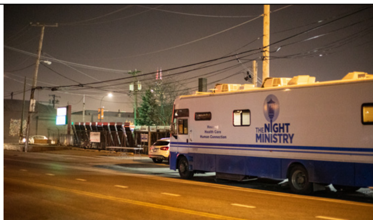
The Health Outreach Bus in Pilsen, a Chicago neighborhood where The Night Ministry serves many clients who speak Spanish.