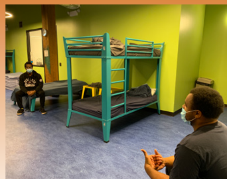
Nordstrom is supporting The Night Ministry's Youth Housing Programs through its Treasure & Bond give-back brand.

So far, the partnership has generated more than $130,000 for The Night Ministry's Youth Housing Programs. We thank Nordstrom for their support of The Night Ministry's mission. Visit www.nordstrom.com/brands/treasure-and-bond to learn more.