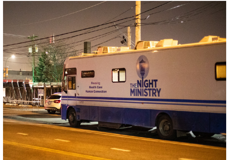
The Health Outreach Bus has continued to make all of its stops during the COVID-19 pandemic.