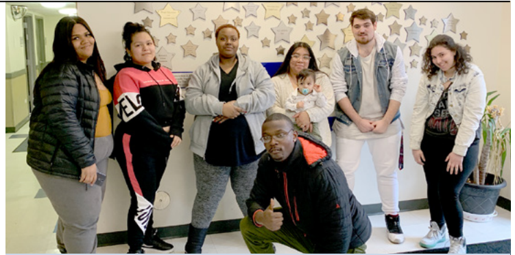
Members of the most recent Youth 4 Truth cohort devoted discussions to food insecurity and the importance of elections.